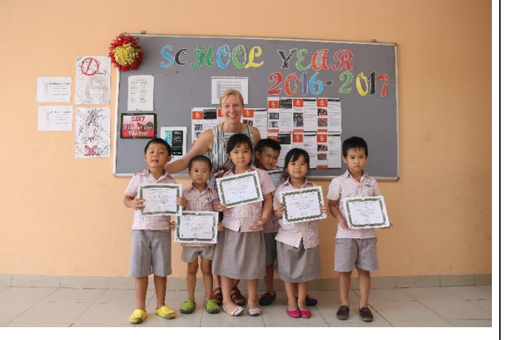
<u>These Academic Achievers from Prep</u> Have learned their 100 Basic Sight Words already!