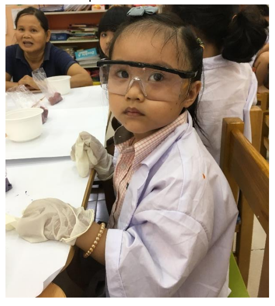
PRE-SCHOOL SOAP MAKING DAY Pre-school enjoyed pretended to be scientists, Mixing the ingredients to make a bar of soap.

Address: Lot F7, Le Loi street, Binh Duong New City, Hoa Phu ward, Thu Dau Mot City, Binh Duong Province, Vietnam