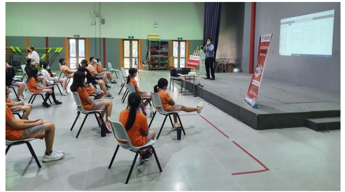
Our senior students watching the Hackathon presentations with interest