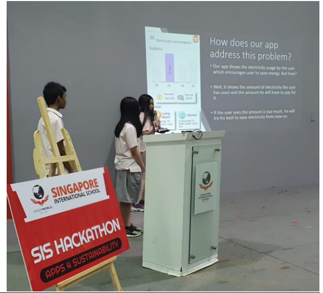
IGCSE 1 presentation