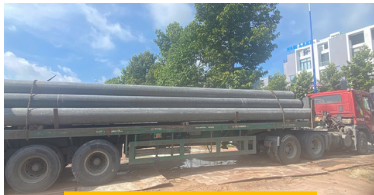
Commencement of construction with piling structures