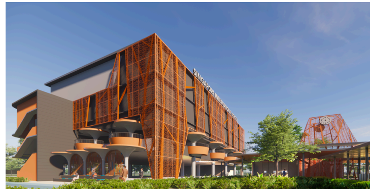
Phase 3 building project of SIS @ Binh Duong New City. The image is for illustrative purposes only and may differ from the actual building.