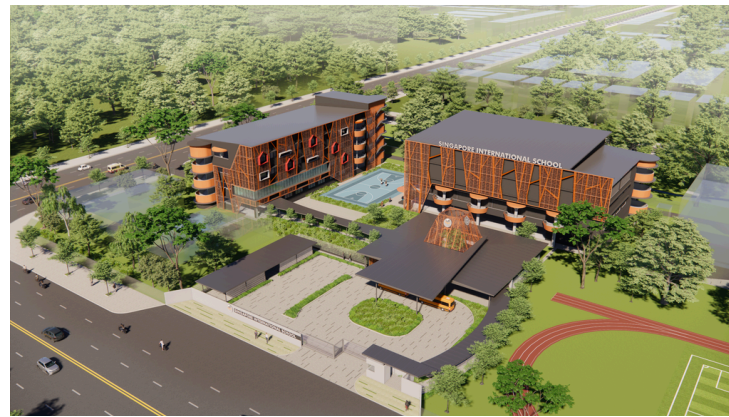
Phase 3 building project of SIS @ Binh Duong New City. The image is for illustrative purposes only and may differ from the actual building.

The inclusion of ample spaces for artistic and athletic development underscores the school's dedication to continuously nurturing students' academic but also creative, and physical growth.